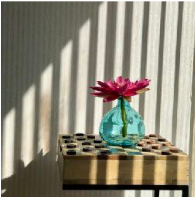
Jennifer Rogers, "No Move" 22 pts. AW