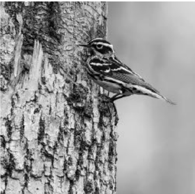
Sandra Tipton, "Black & White Warbler", 23 pts. HM