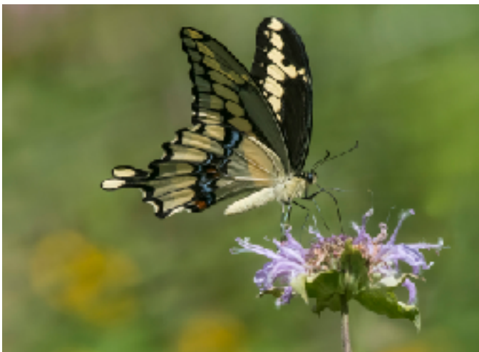
ra Tipton, "Eastern Giant Swallowtail", 23 pts. AW BOS