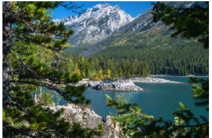
Reinhard Schwind, "Banff National Park", 23pts. HM