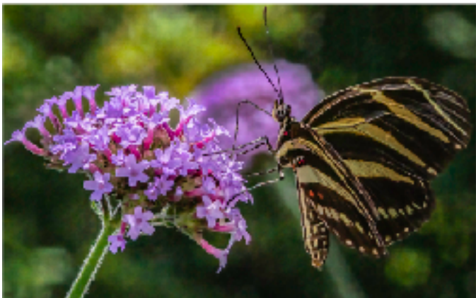
Alfredo Rodriguez, "Butterfly Feeding", 24 pts. AW