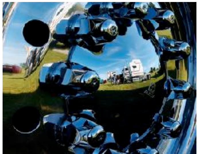
Mark Becker, "Big -Rig Wheel Reflection", 22 pts AW