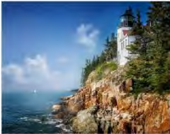
Larry Arends, Bass Harbor Lighthouse, Small Color AW-25