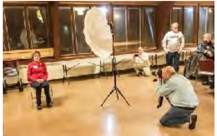
Using a diffusing umbrella to provide less intense light from the side.