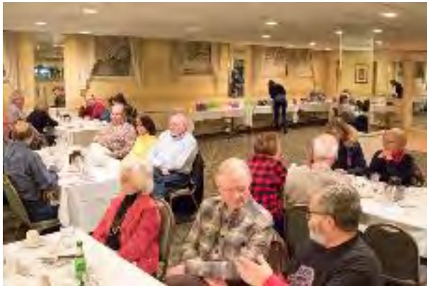
A scene from our dinner.