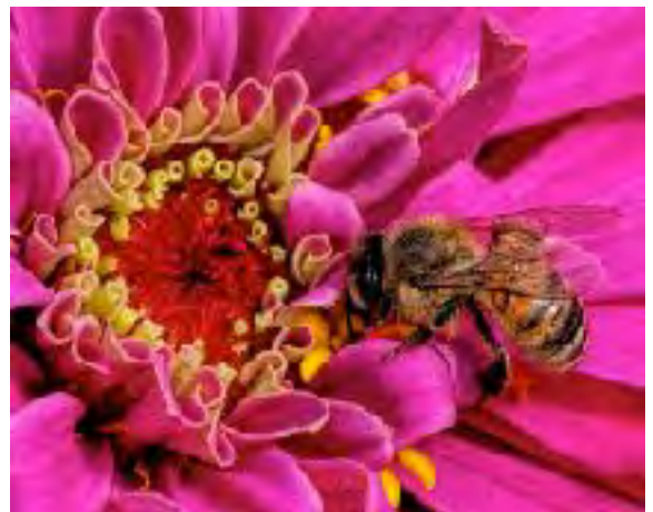
Ken Olsen, Busy Bee, Small Color, AW-23