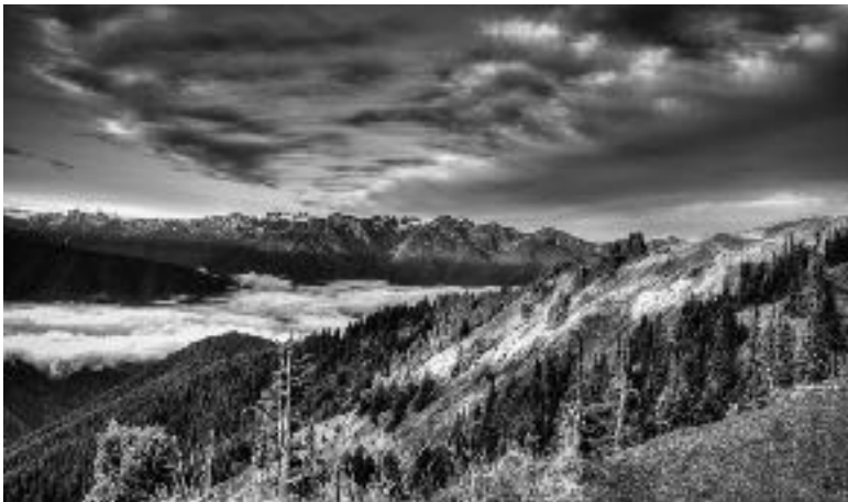
Rich Hassman, Ridge Mountain - Small Mono HM-23