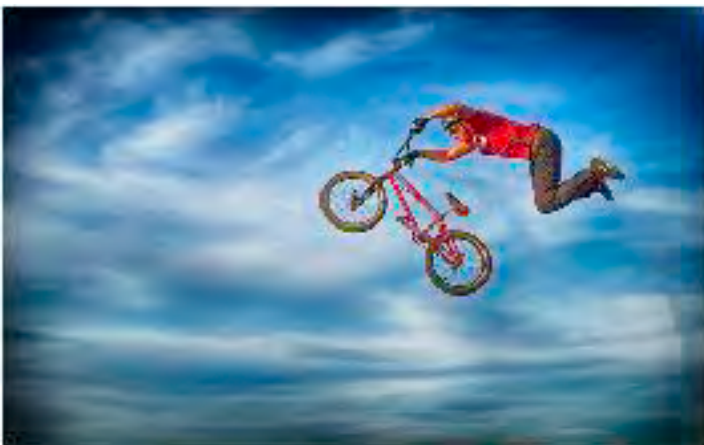
Randy Vleck, Flying High, DPI Color HM-24