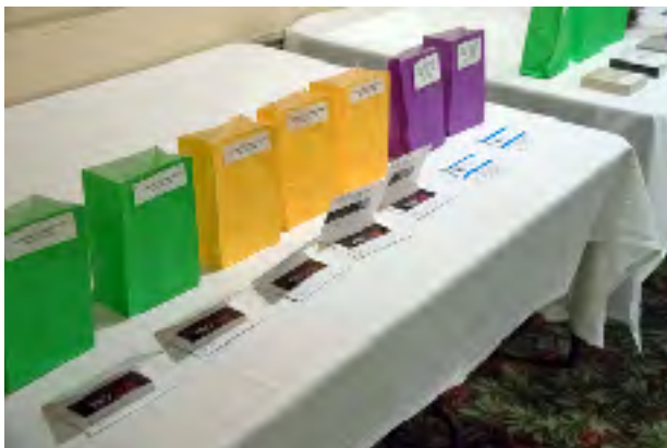
A sampling of our raffle prizes.