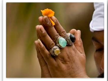
Balinese Priest by Ralph Childs