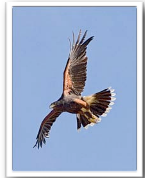
Harris' Hawk