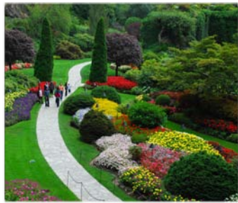
Garden with Walk by Tracey Armenakis