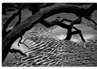
Tidal Pools by Norm Plummer