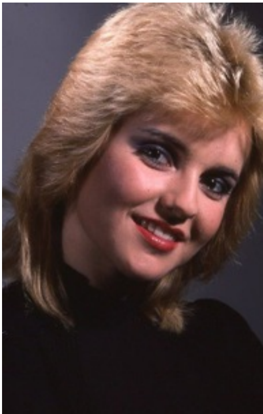
3rd, Blonde in Black by Jeff Berman