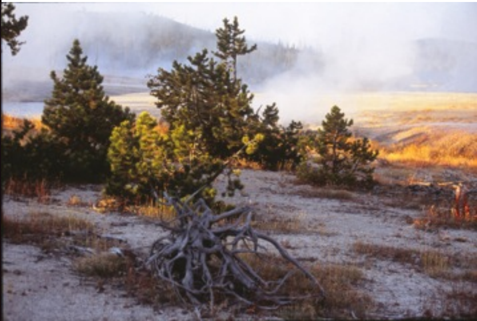
2nd, Foggy West Yellowstone