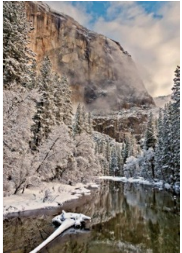
El Cap & The Merced by Pat Grady