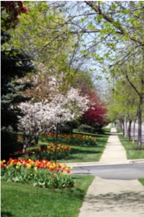
present photography from the Spring Colors By Albert Teitsma Southern Seas.