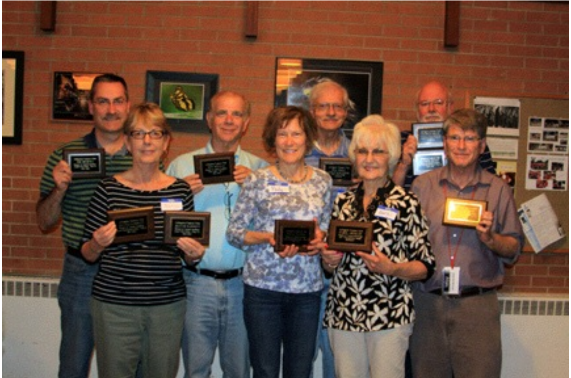
Winners of Annual Standings