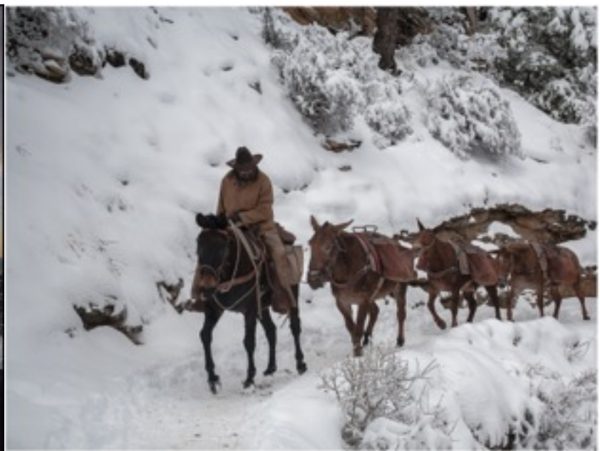
3rd, Cold Climb by Bill Bible