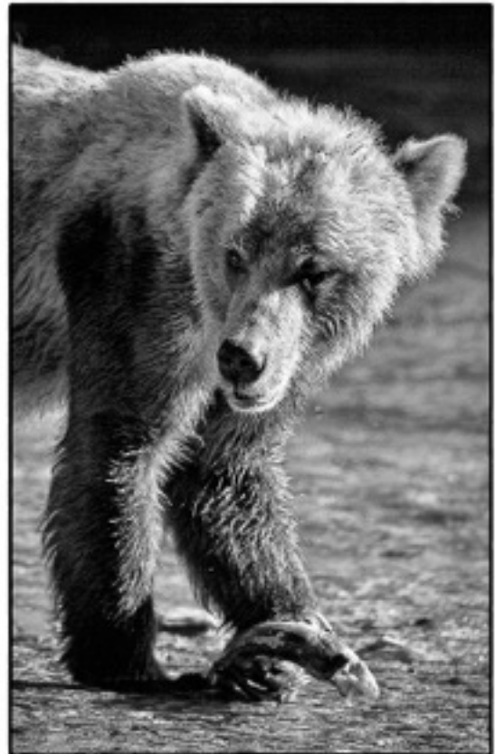
2nd, A Good Day Fishing by Kent Wilson