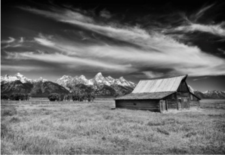
1st, Teton Barn